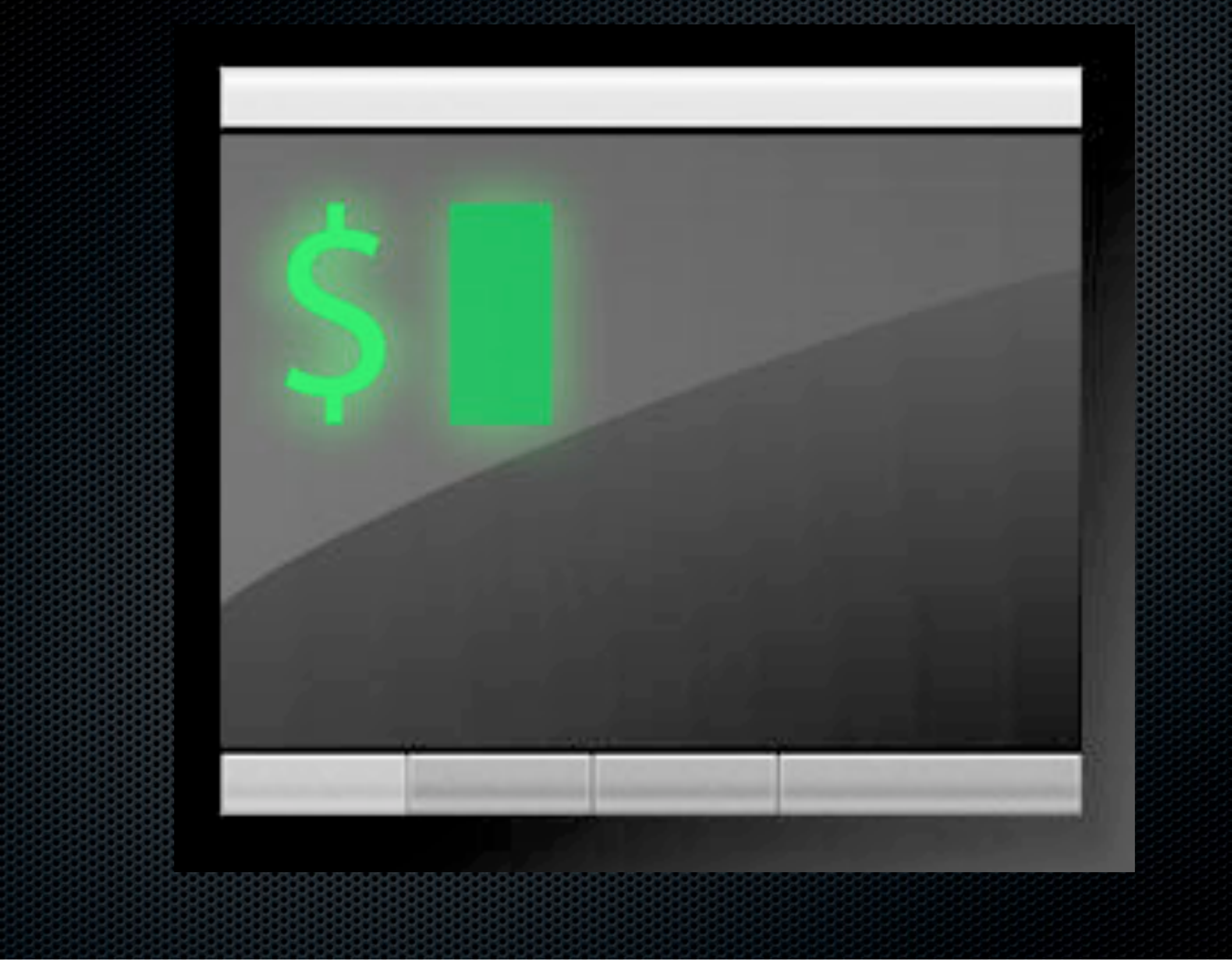
iTerm2 released! http://code.google.com/p/iterm2/downloads/list